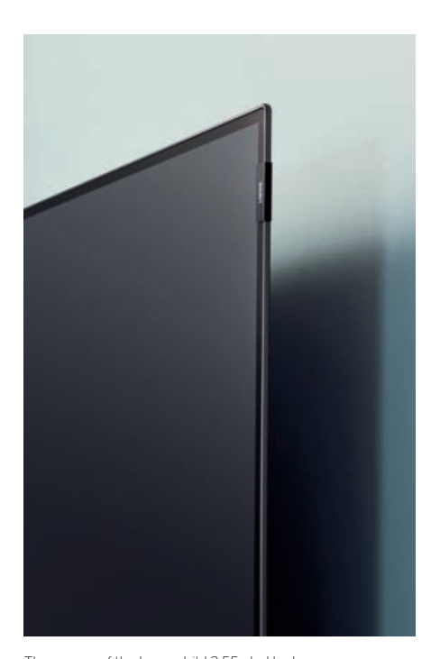
The screen of the Loewe bild 3.55 oled looks light and delicate – despite an impressive 55" diagonal.

Loewe bild 3.55: your gateway to the fascinating world of OLED television – high-tech with soul for your living room.