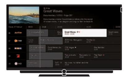
The beautifully simplified EPG design allows you to see what's on TV and to set recordings with ease.

The customisable home screen makes it even easier to access and manage your favourite channels, connected devices and recordings.