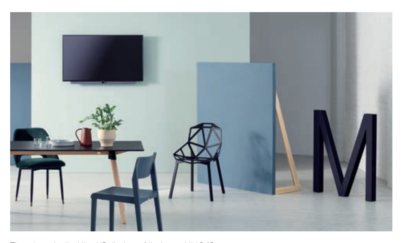
The extremely slim Ultra HD displays of the Loewe bild 3.43 and Loewe bild 3.49 offer four times more resolution (3,840 x 2,160 pixels) than Full HD. The result is crystal-clear details, perfect contrasts and amazingly vibrant colours.

LCD technology with integrated DR+ hard disk – the perfect TV for the kitchen or office. DR+ is available as an option with the Loewe bild 3.43 and Loewe bild 3.49.